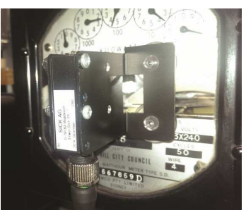
Ferraris Disc Pick up